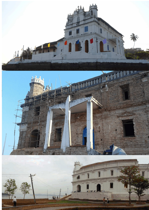
Fig.1 – Photograph of Nossa Senhora de Penha de França church pre and post-restoration.

Nossa Senhora de Penha de França church is a seventeenth century church built in mannerist neo-roman style resting on the banks of River Mandovi in Panjim, Goa.