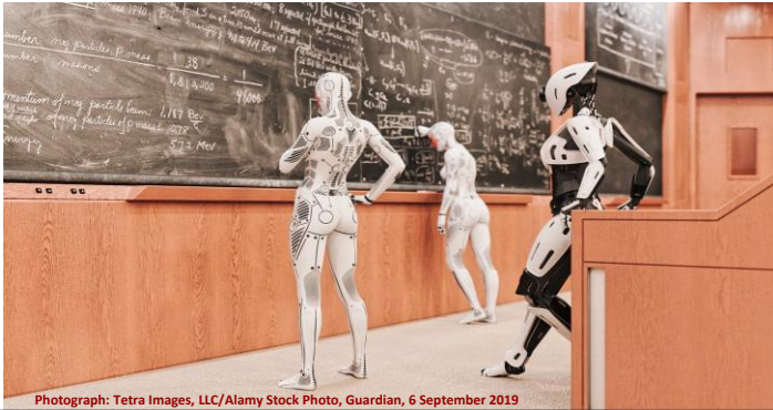
Photograph: Tetra Images, LLC/Alamy Stock Photo, Guardian, 6 September 2019